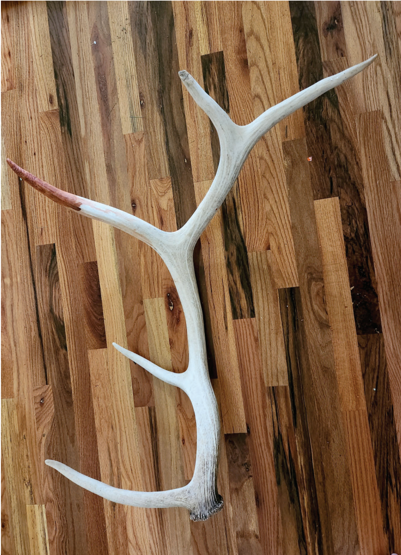
Photo of antler used in stabbing