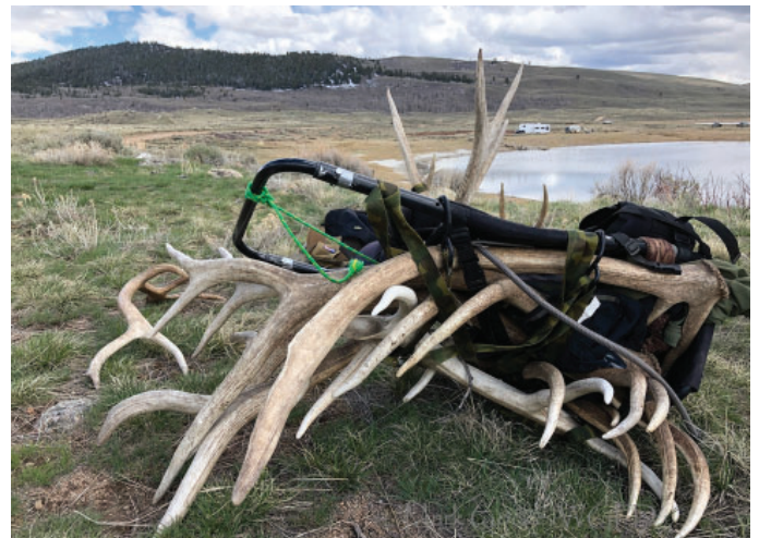
Shed antlers collected and ready to pack out of one of Wyoming’s regulated antler gathering areas. Competition among shed hunters is intense, especially as the season opens.